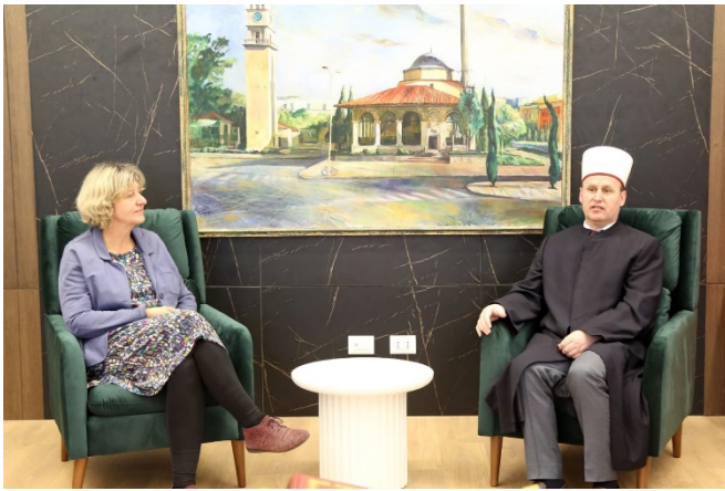
The delegation continued with several

Community of Albania, where participants discussed the role of universities in educating young generations with common values for the preservation of the environment and ecology.